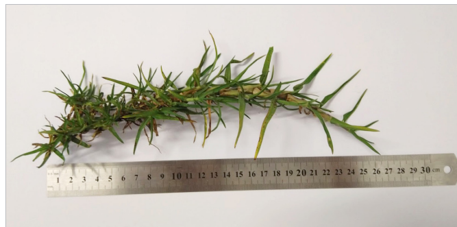
Fig 3. Close-up of live stolon.