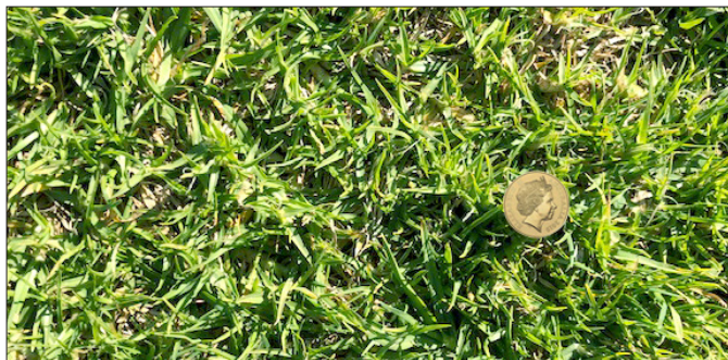
Fig 2. Eureka Kikuyu grassed area.