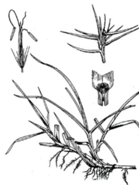
Fig 1. Stolon and leaf structure illustration.