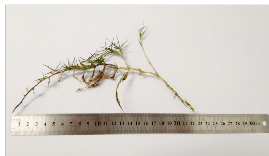
Fig 3. Close-up of live stolon.