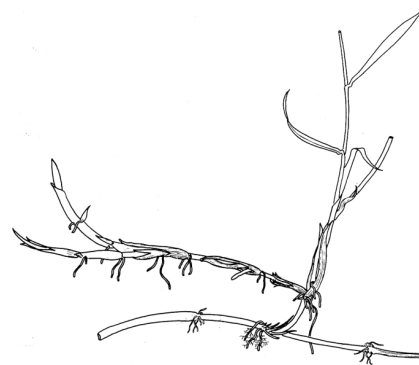
Fig 1. Stolon and leaf structure illustration.