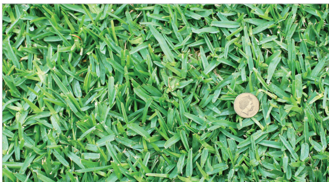
Fig 2. $2 coin on wide shot of grassed area.