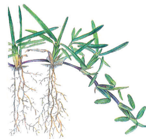
Fig 1. Stolon and leaf structure illustration.